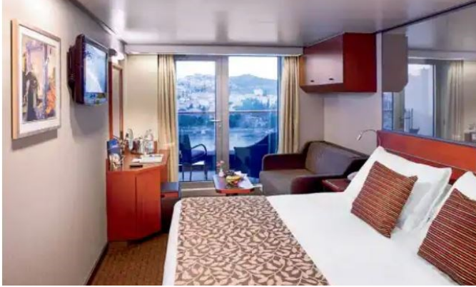
Balcony rates start at $4,799

(Per person based on double occupancy. Single, triple & quad rates are available.)