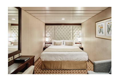
Interior Stateroom $4,899.00