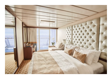
Mini Suite Stateroom $6,299.00

Standard amenities include a hair dryer, refrigerator, TV, closet and bathroom with shower