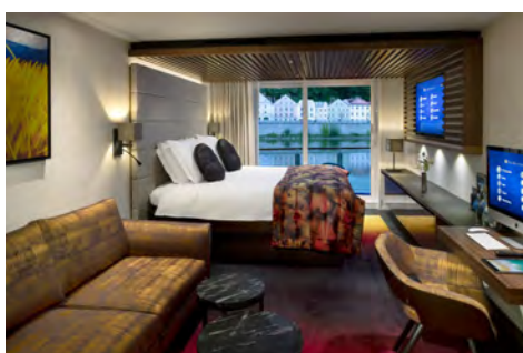
Category AA Upper Deck Outside Balcony