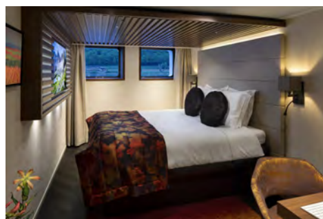
Category D Lower Deck Fixed Window