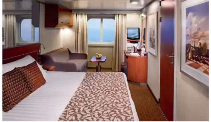
Oceanview rates start at $4,199