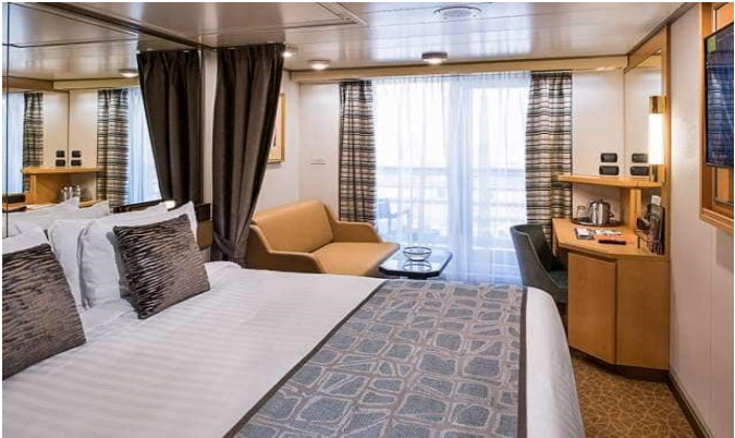
Balcony rates start at $3499.00 per person