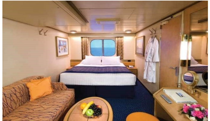
Oceanview rates start at $3099.00 per person