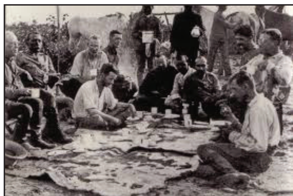
Scene from the River of Doubt Expedition