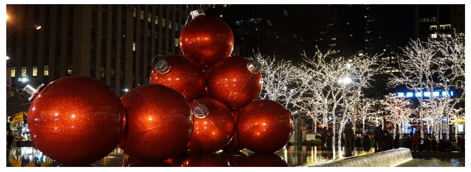
Tour with flights from Bismarck: (Rates are per person based on double occupancy.)