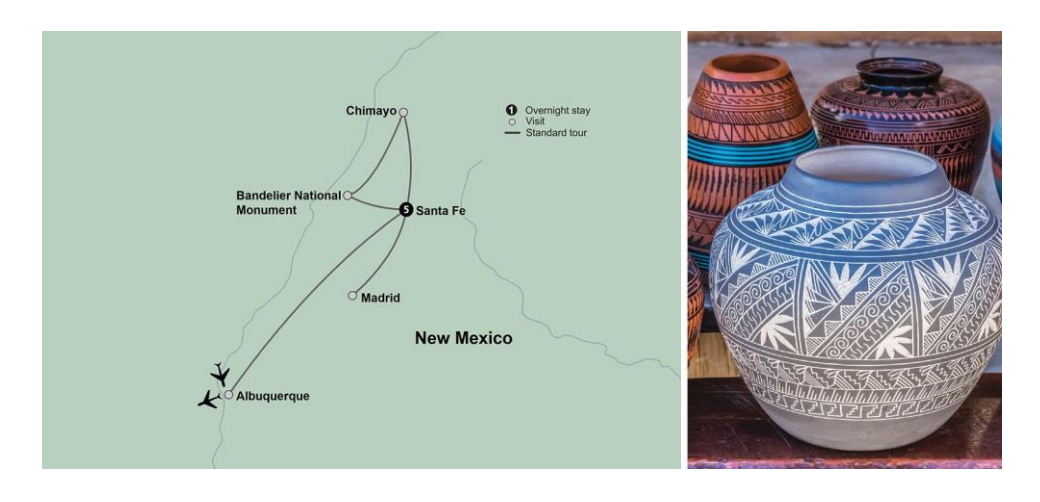
6 Days ● 8 Meals : 4 Breakfasts, 2 Lunches, 2 Dinners