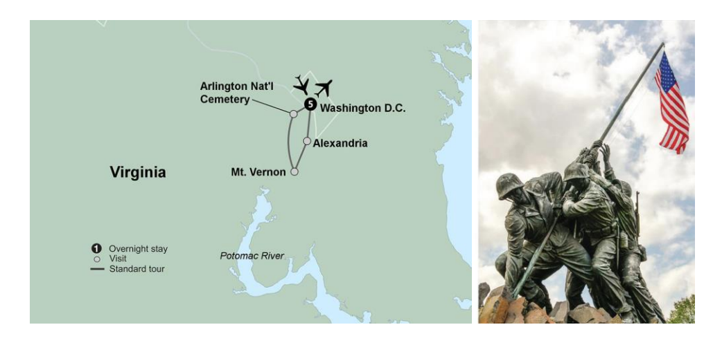
6 Days ● 8 Meals : 5 Breakfasts, 3 Dinners